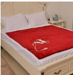
Red Electric Heated Micro Plush Flannel Sherpa Throw Blanket (50x60 in)