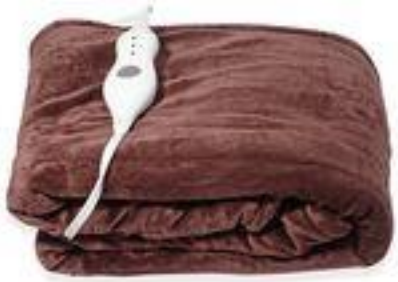
Brown Electric Heated Micro Plush Flannel Sherpa Throw Blanket (50x60 in)