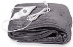
Gray Electric Heated Micro Plush Flannel Sherpa Throw Blanket (50x60 in)