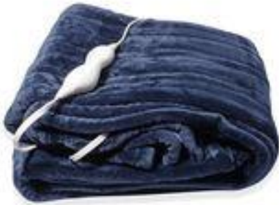
Blue Electric Heated Micro Plush Flannel Sherpa Throw Blanket (50x60 in)