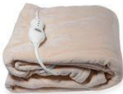
Beige Electric Heated Micro Plush Flannel Sherpa Throw Blanket (50x60 in)